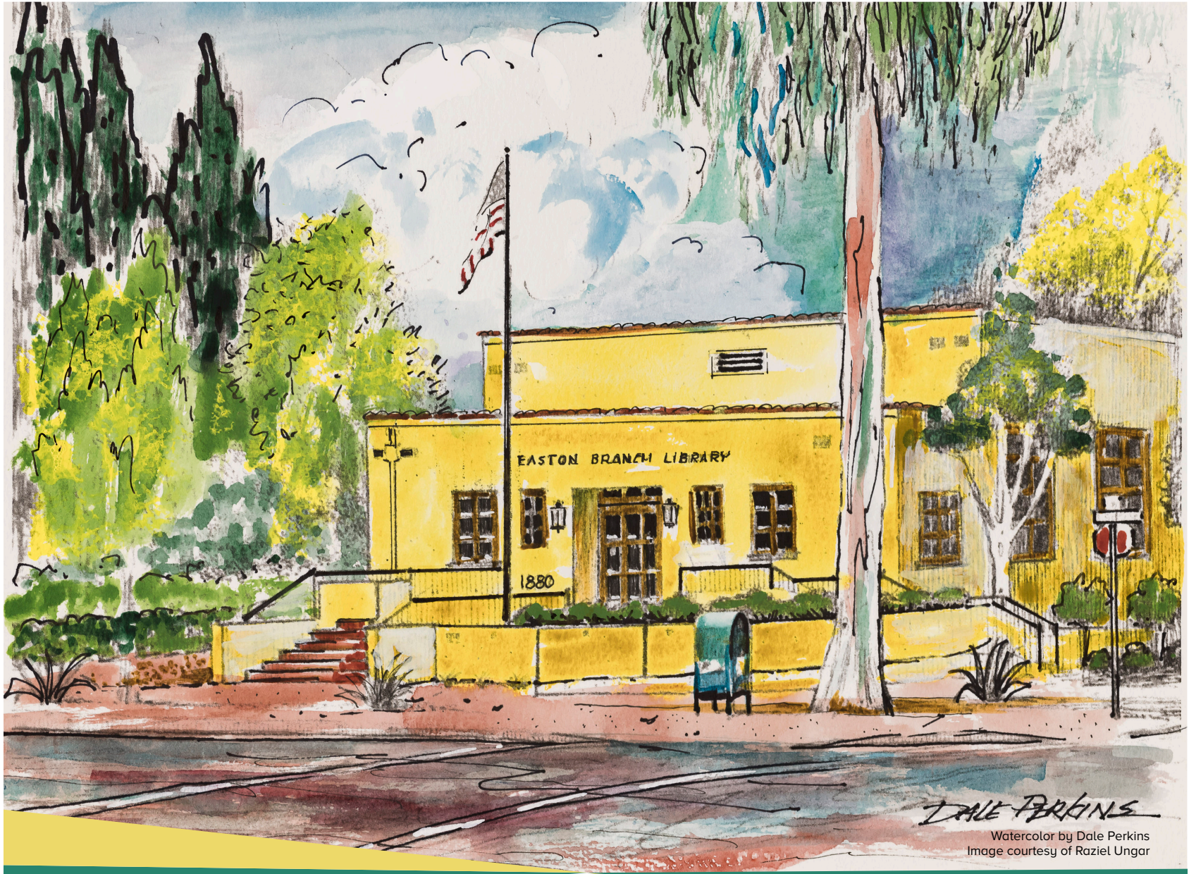
Watercolor by Dale Perkins